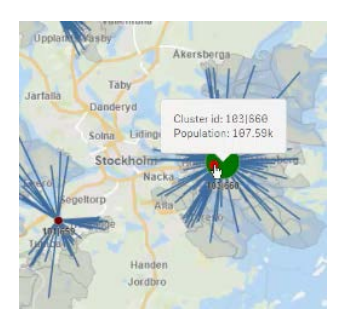
Cluster function to determine which hub is the closest to each municipality

Qlik GeoAnalytics allows organizations to go beyond map visualizations to understand and analyze geospatial relationships. Gain insight into patterns not easily interpreted through tables or charts. The power of Qlik's associative model can be applied to analyze geo data relationships with non-geo data as well as uncover non-relationships. Easy incorporate external geospatial data or map layers into your visualization or analysis; even import spatial information such as CAD files for indoor mapping applications.