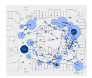
Path analysis of customer traffic within shopping center

With a full spectrum of mapping and geospatial capabilities that share a common set of tools and technologies, Qlik GeoAnalytics can meet the needs of a wide variety of location-related use cases. Qlik GeoAnalytics offers customers the flexibility to implement a fully hosted solution, a completely on premise implementation or a combination of the two. And having already been implemented in multiple industries and across different business functions, one can be confident that Qlik GeoAnalytics can meet the specific requirements of a customer's geospatial project.